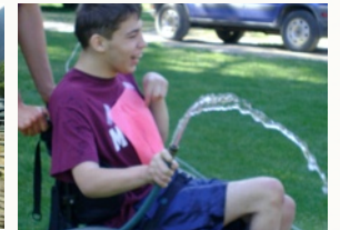
Swimming and water games