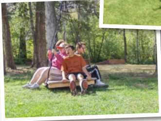
Campers enjoying activities

Come enjoy all camp has to offer through Achieve camps. Summer adventure camps are now available for people with disabilities. Allow our staff to care for your both children and adult campers and help them learn and grow through first hand experiences. Interested in a get away for you and your family? Enjoy God's creation through hikes or the river. Come and challenge yourself and your children through rafting, rock climbing or challenge courses. Trust a professional staff to take care of your family. Contact us for more information.